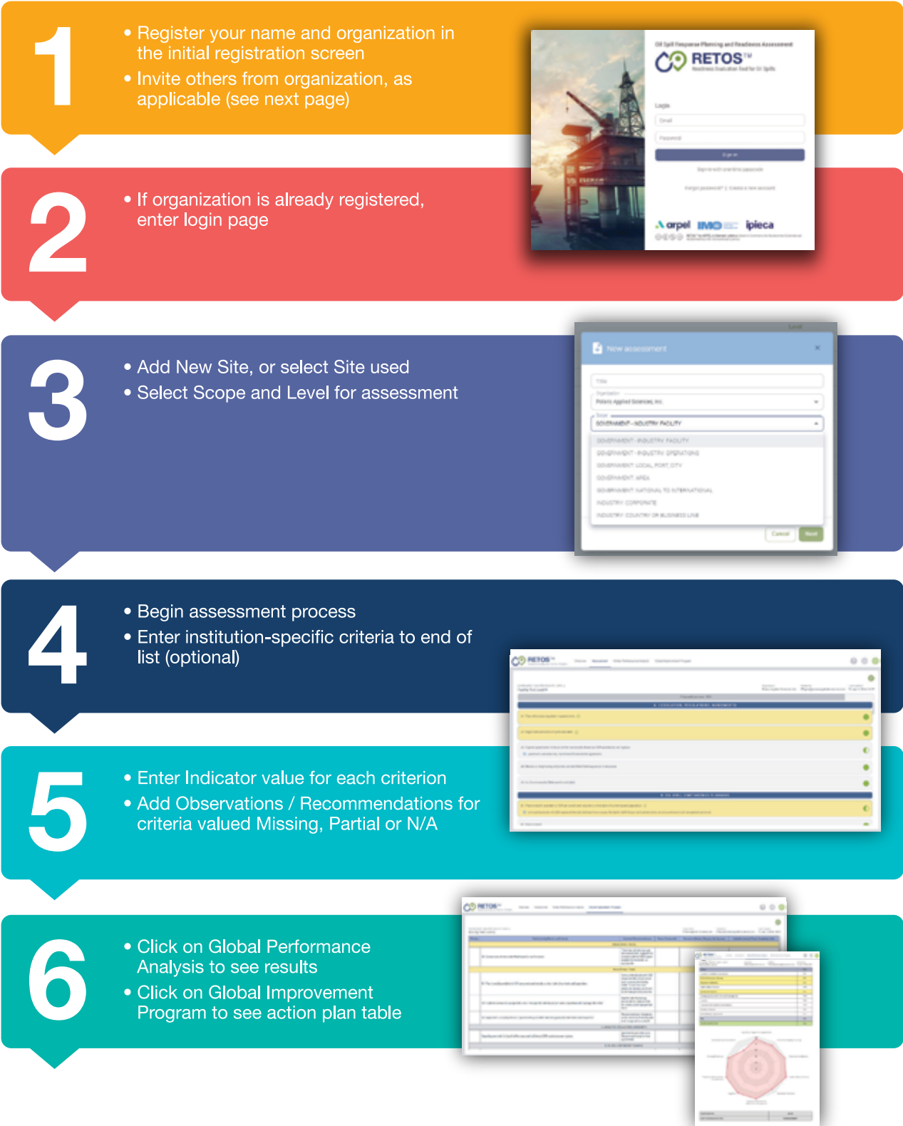
Figure 2 - Steps in using RETOS™ web application