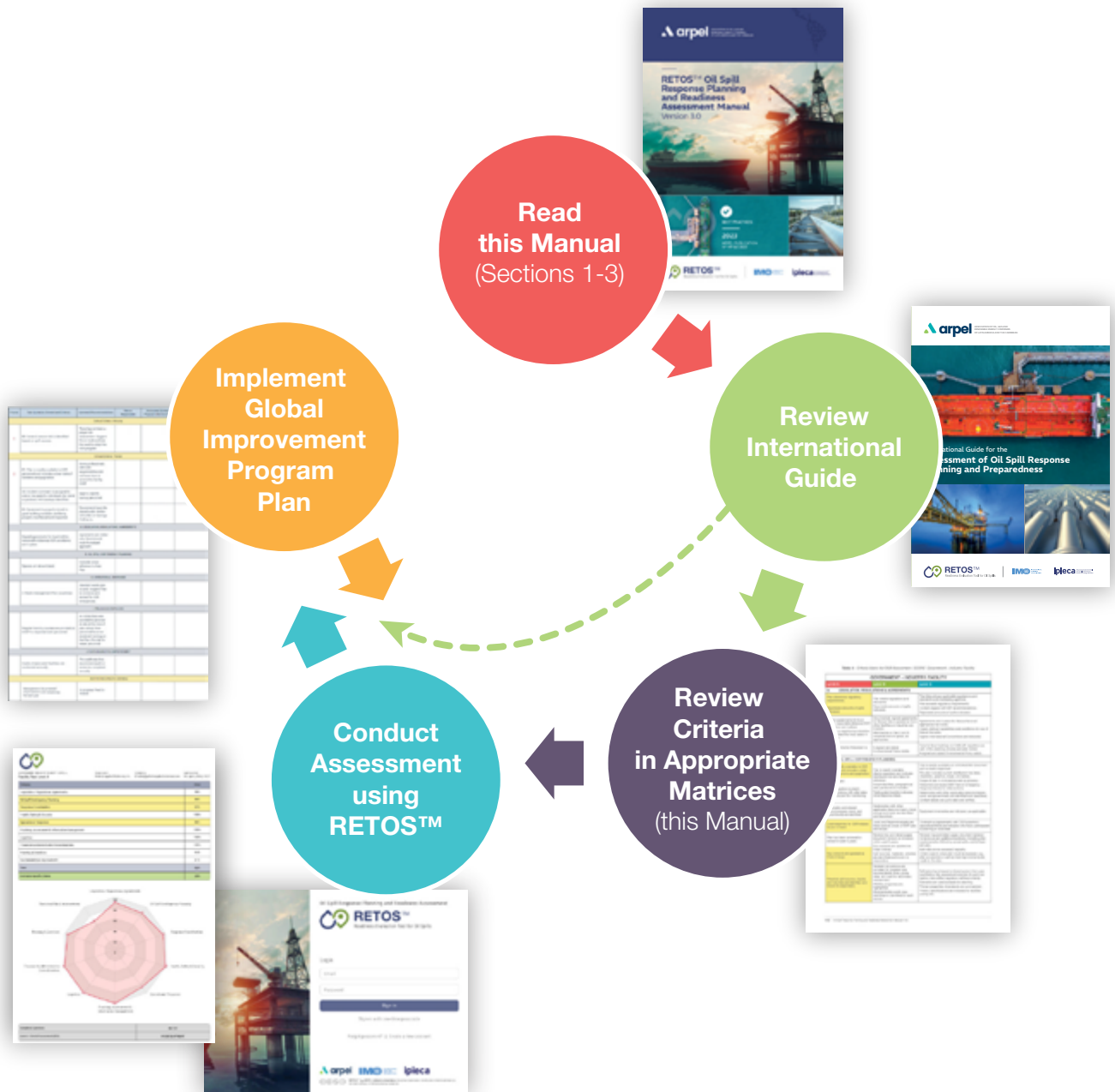
Figure 1 - Overview of how to use this Manual and the RETOS™ web application